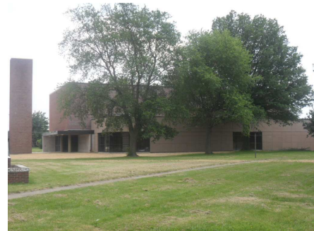
Charger Community Center, 2010